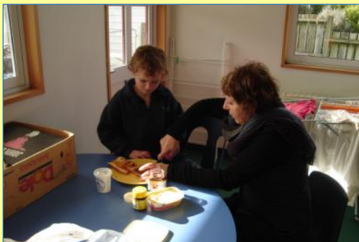
Specialised education designed to support your child's learning.

Our Specialist Outreach Teachers understand the complex needs of students with special educational needs.