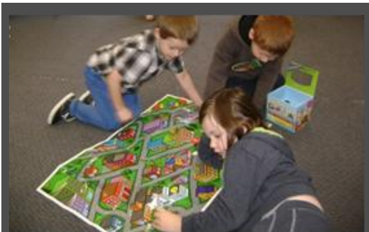
Students join in with peers for sports activities maths and language games.